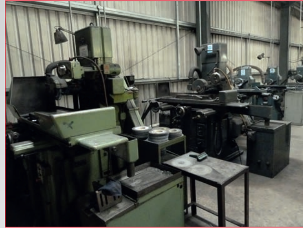
• Jones & Shipman Grinding Machines - Models 1400, 540, 540P, 1011P, 1011, 1300