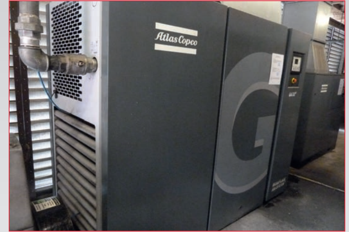
• Atlas Copco GA75+ 8-Bar Compressor (2011)