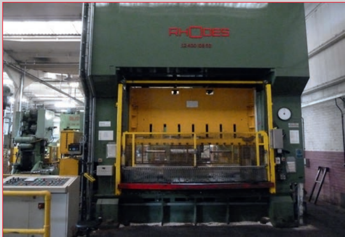
• Rhodes S2-400-108/60 400-Ton Double Sided Press with BHP Decoiler, Leveller, Atkin Servo Feed Unit & Scrap Conveyor, Bed Size: 108" x 60", Shut Height: 12" - 24"