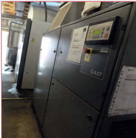
• Atlas Copco GA37 Compressor