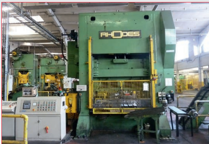
• Rhodes 400-Ton Double Sided Press with Atkin Decoiler, Leveller, Servo Feed Unit & Scrap Conveyor, Bed Size: 60" x 48", Adjustable Stroke: 2" - 8"