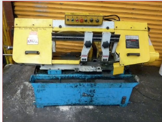
• Excell Bandsaw