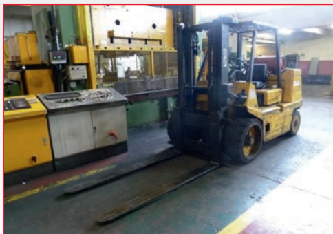
• Hyster 7-Ton Fork Lift Truck