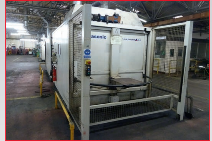
• 3 x Panasonic Perform Arc Robot Twin Pallet Robotic Mig Welding Cells (2002)