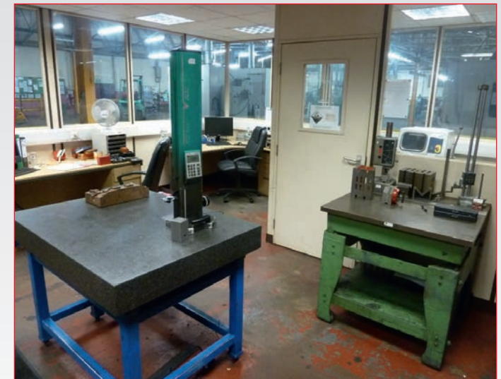
• DEA Swift CNC Coordinate Measuring Machine with Renishaw PH10T Probe