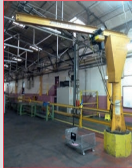
• 500kg Jib Crane