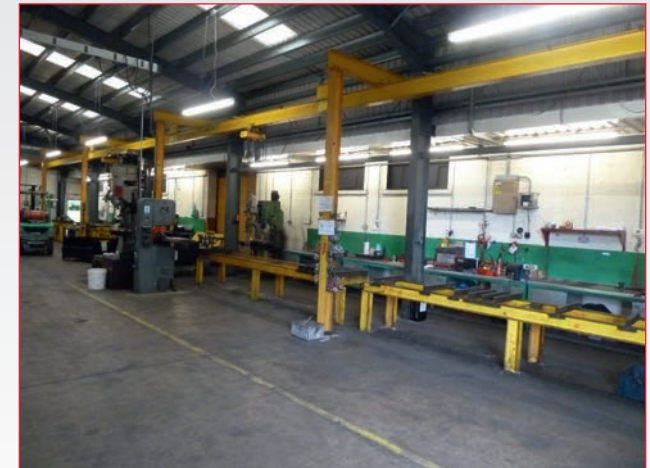
• Overhead Crane & Tressels, 2000kg Capacity

Viewing by Appointment only, please contact our Office on: