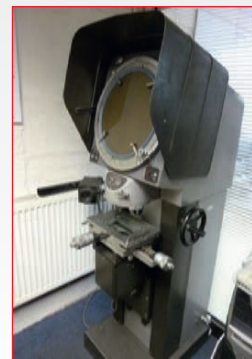
• Qty Inspection Equipment