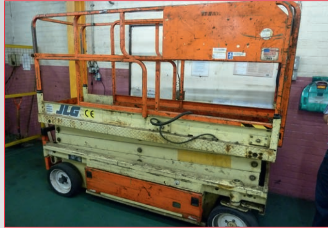
• Scissor Lift