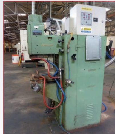
• Sciaky 75kVA Welder