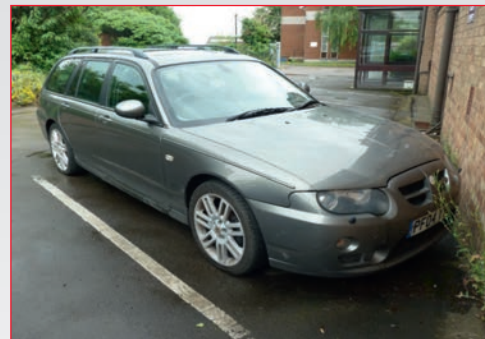
• MAN (Diesel) Curtain Sided Truck, Registration Plate: 56, 3-Ton Capacity