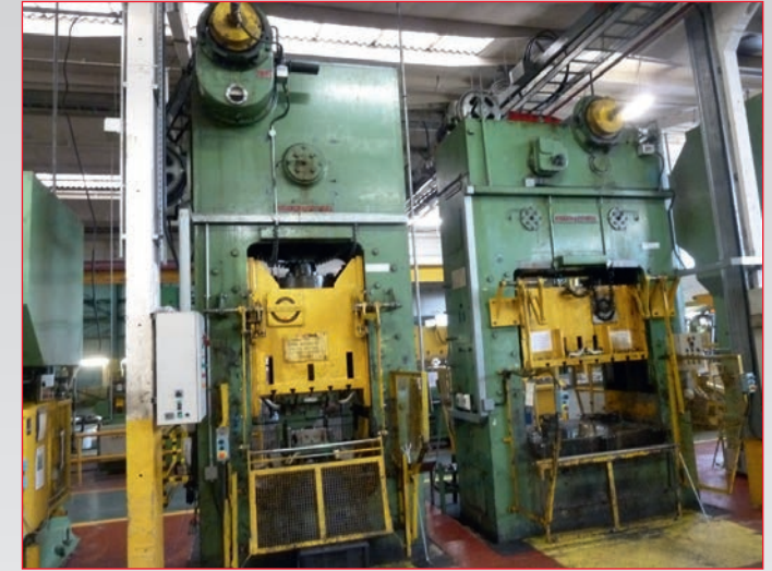
• Wilkins & Mitchell 350-Ton & 250-Ton Double Sided Presses - 350-Ton Bed Size: 42" x 30", 450-Ton Bed Size: 66" x 48"