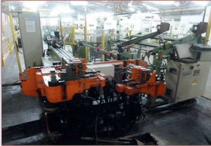
• Bema CNC Tube Bender