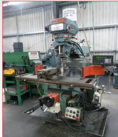
• Pinnacle Turret Mill