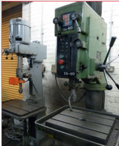
• IBA & Pollard Drills