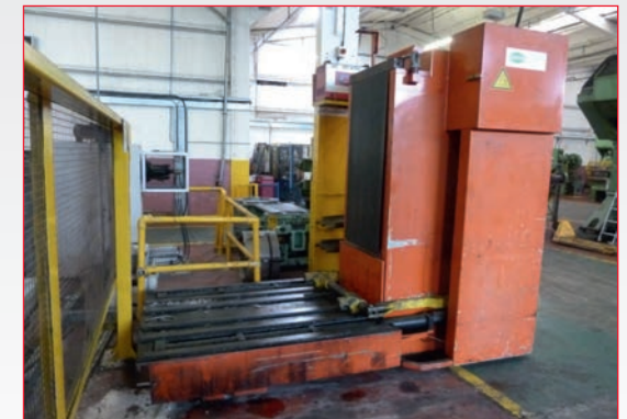
• Herwo 13-Ton Capacity Electric Die Loader (1999)

Viewing by Appointment only, please contact our Office on: