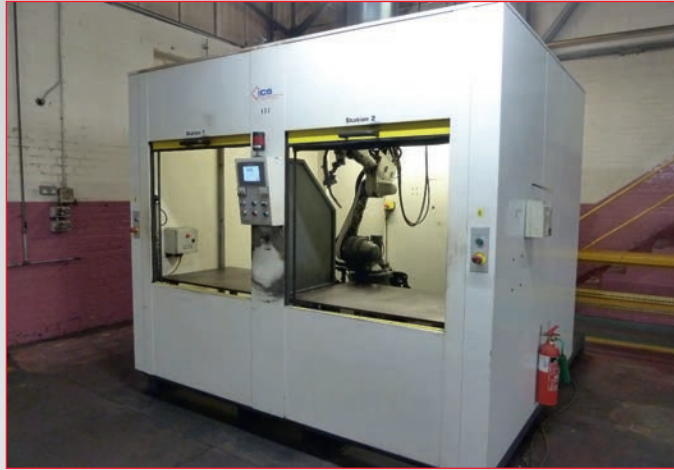
• 8 x Panasonic Twin Station Robotic Mig Welding Cells (1998-2010)