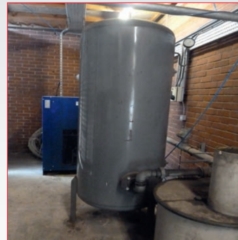
• Abbott Receiver