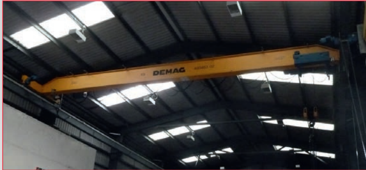
• Overhead 10-Ton Crane