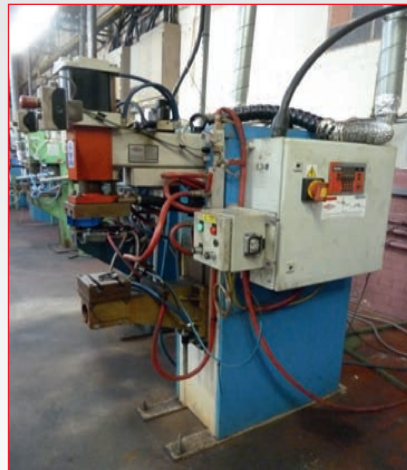
• Meritus 150 kVA Spot Welder