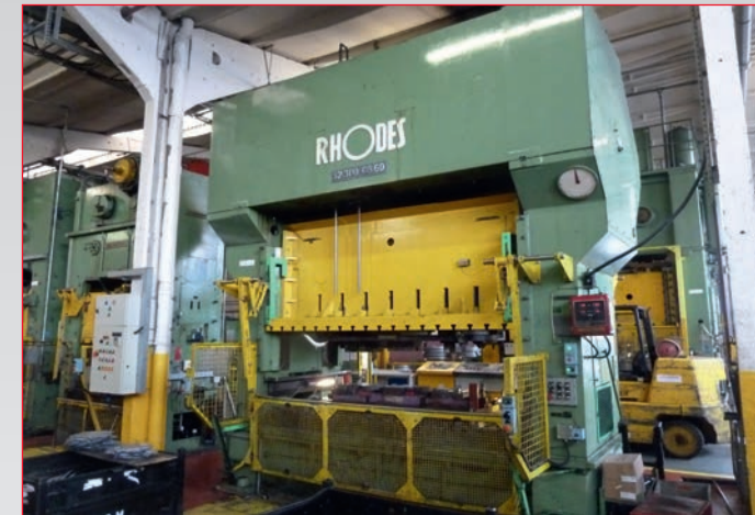
• Rhodes S2-300 108-60 300-Ton Double Sided Press, Bed Size: 108" x 60"