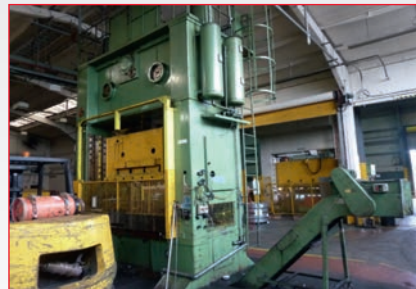
• Stanko 315-Ton Double Sided Press with Clark Decoiler, Atkins Leveller, Servo Roll Feed & Scrap Conveyor, Bed Size: 2500mm x 12500mm