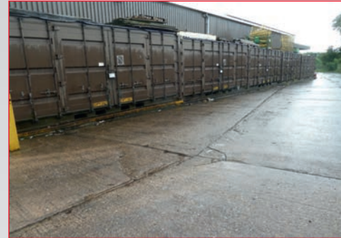
• 10 x 20ft Storage Containers—End & Side Opening