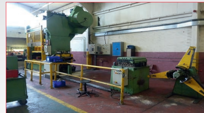
• Rhodes 200-Ton Double Sided Press with BHP Decoiler, Leveller, Servo Feed Unit & Scrap Conveyor, Bed Size: 72" x 42", Shut Height: 16" - 34"

For Printable Catalogue, Photographs & Full Information please visit our Website: www.cottandco.com