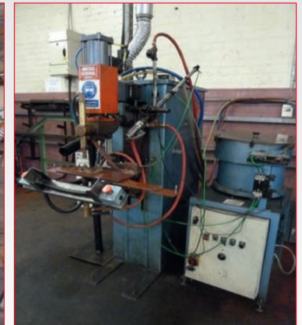
• British Federal 63 kVA Welder with Bowl Feed