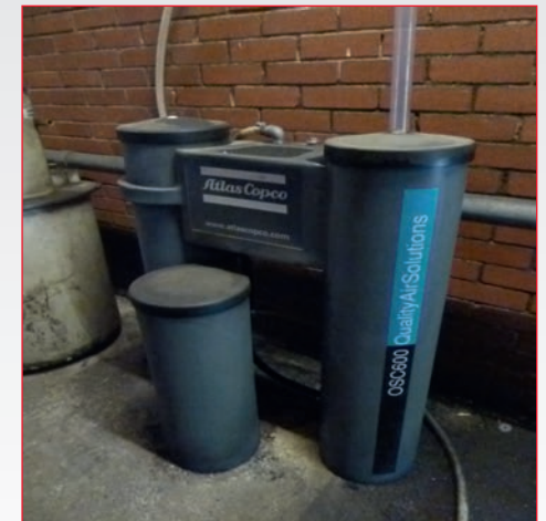
• AC OSC600 Oil/Water Separator

Viewing by Appointment only, please contact our Office on: