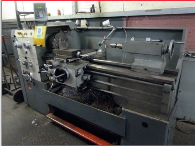
• Excel XL 1640 Centre Lathe