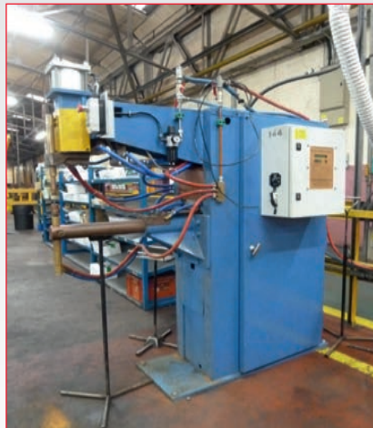
• Sciaky 70 kVA Spot Welder