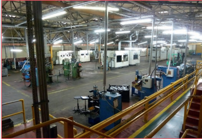
• Overall View of the Welding Shop