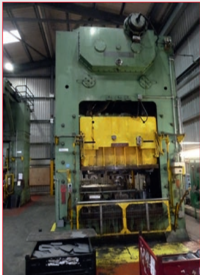
• Wilkins & Mitchell 450-Ton Double Sided Press, Bed Size: 86" x 46", Shut Height: 16" - 34", 12 1/2 spm— 20" Stroke