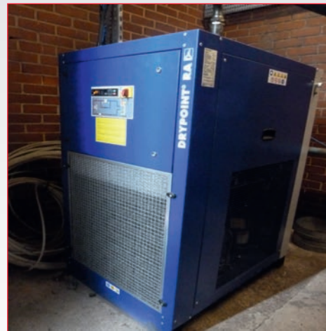
• Drypoint RA Dryer