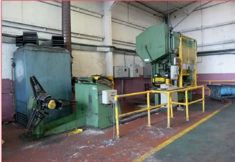
• Rhodes 150-Ton Double Sided Press with BHP Decoiler, Leveller, Servo Feed Unit & Scrap Conveyor, Bed Size: 56" x 40"