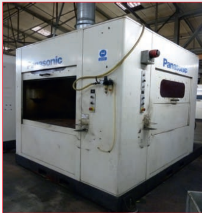
• Panasonic Twin Station Robotic Mig Welding Cell (1996)